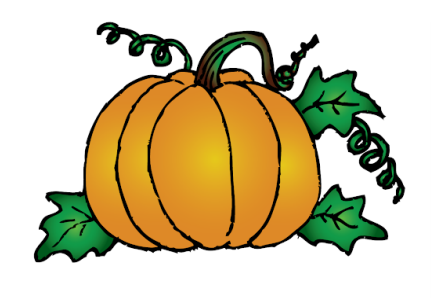
19 Alyssa Montague