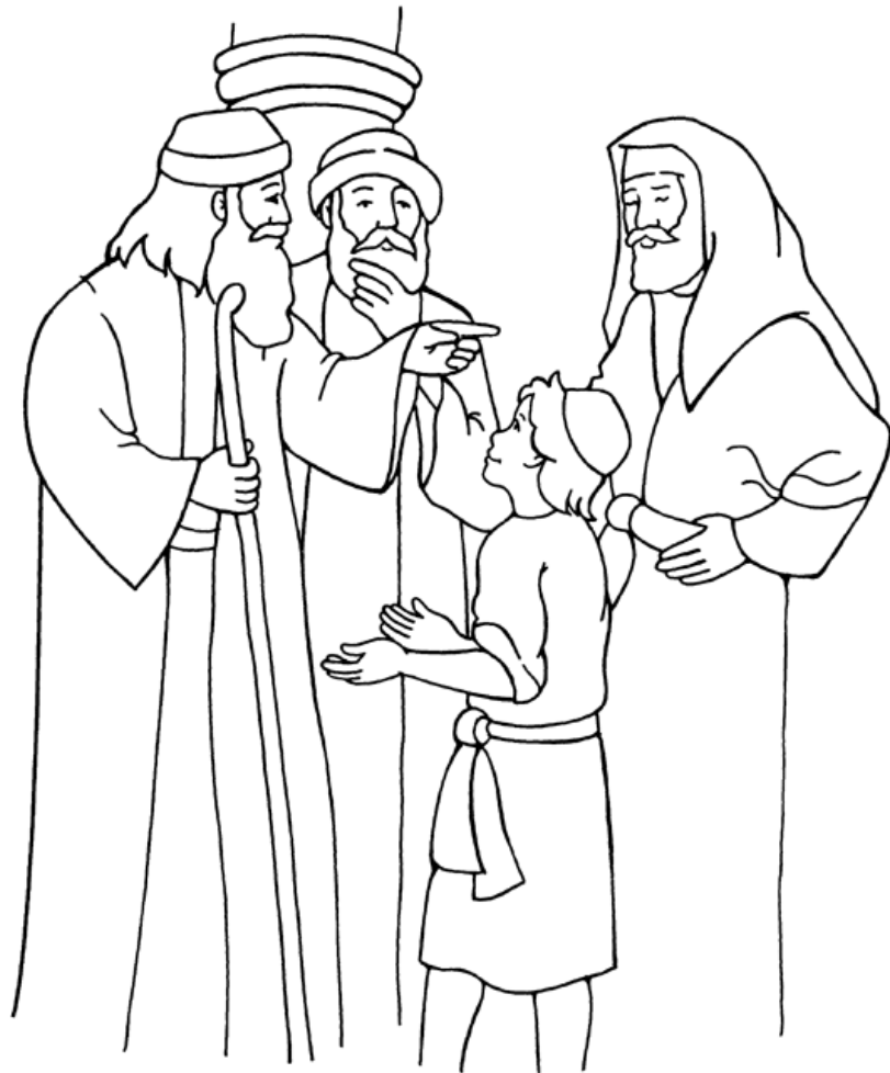
Jesus in the Temple Luke 2

From Thru-the-Bible Coloring Pages for Ages 4-8. © 1986,1988 Standard Publishing. Used by permission. Reproducible Coloring Books may be purchased from Standard Publishing, www.standardpub.com .